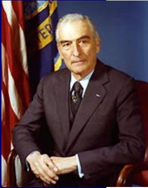
Honorable Edward Hidalgo, Secretary of the Navy. B. 1912, d. 1995.