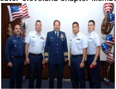
Greater Cleveland Chapter Members