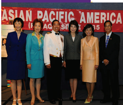
The new FAPAC officers were inducted in September

Need a National or Chapter ANSO officer email? Check out our website: www.ansomil.org