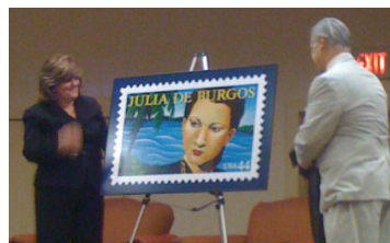
Official unveiling of the Julia de Burgos Stamp

Get involved! Find out what your local chapter is doing. No chapter near you? Start your own!