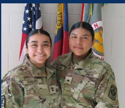
Credit: Cadets From Union High School April 21, 2023