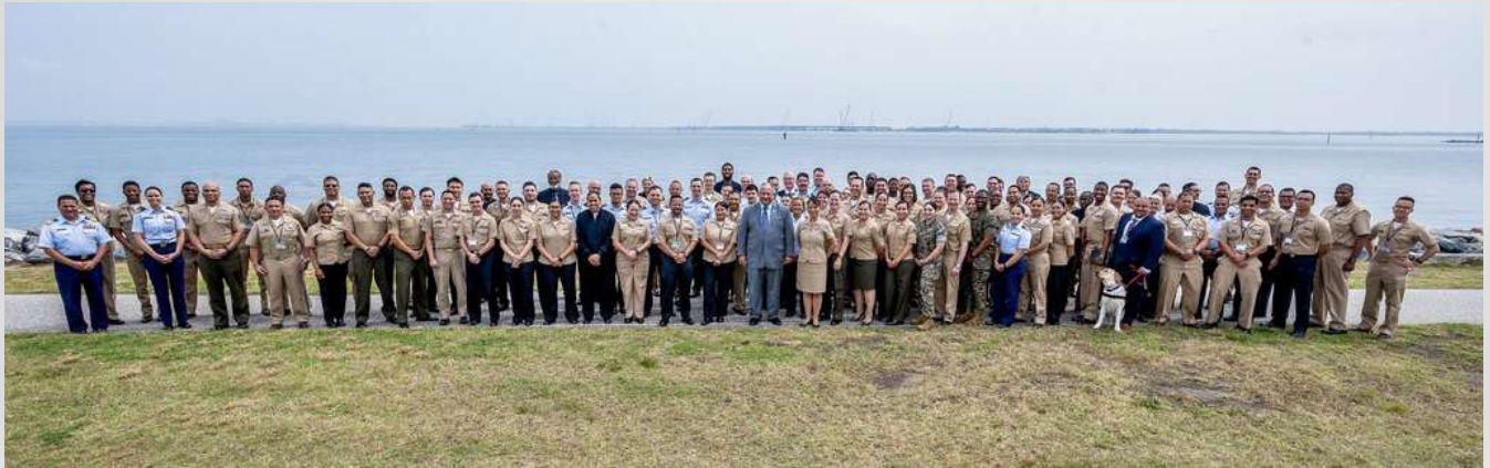
WASHINGTON (June 8, 2023) Secretary of the Navy Carlos Del Toro attended the 2023 Association of Naval Services Officers (ANSO) Eastern Regional Symposium in Naval Station Norfolk.

The official newsletter of Association of Naval Service Officers (ANSO)